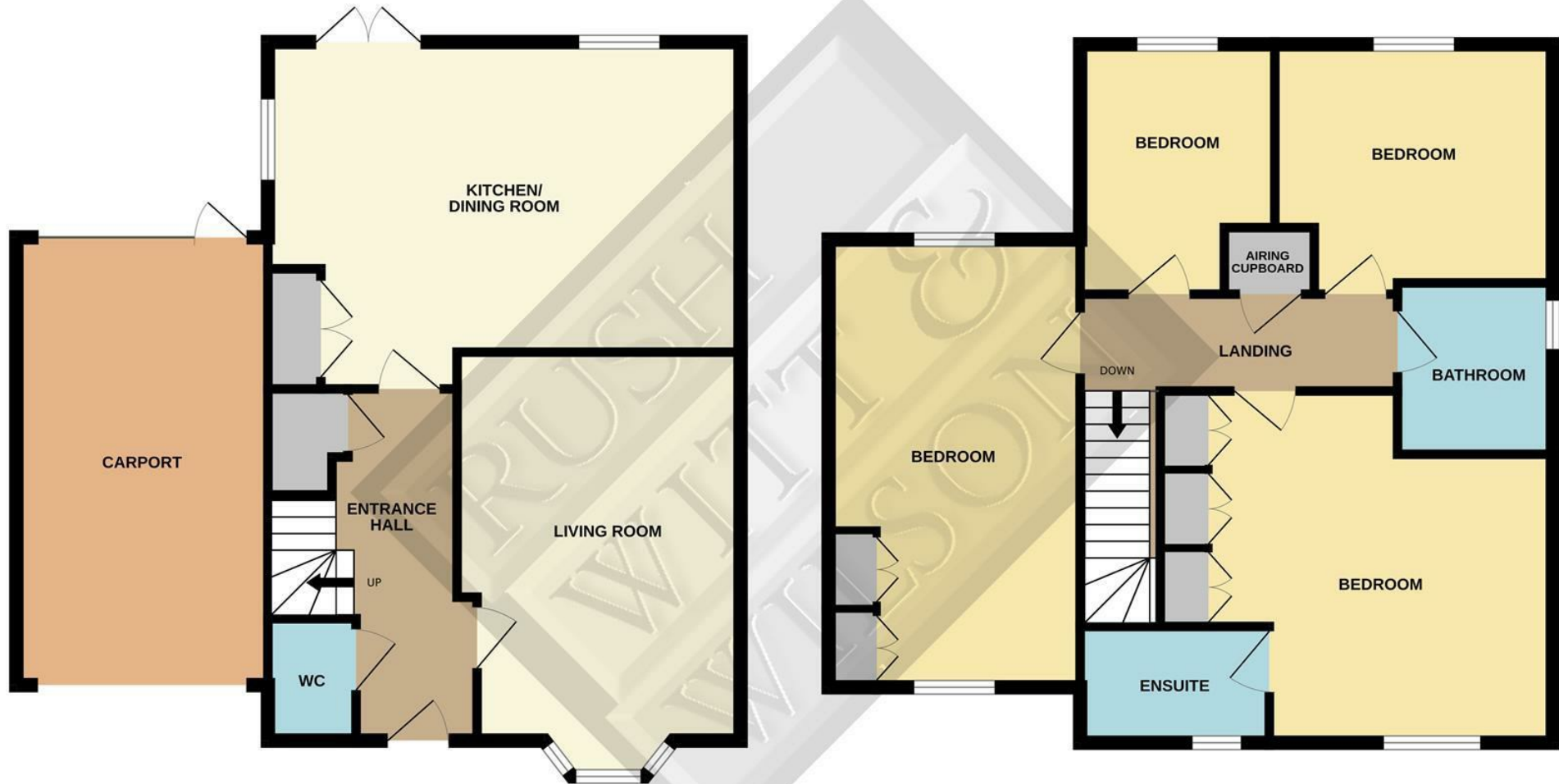
1ST FLOOR 743 sq.ft. (69.0 sq.m.) approx.

TOTAL FLOOR AREA : 1491 sq.ft. (138.6 sq.m.) approx.